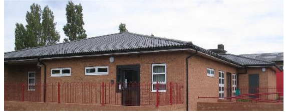
New Blackgates Primary School

That the Director of Development be asked to expedite the Heads of Terms with Mintons as quickly as possible, preferably within 30 days