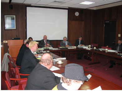
Scrutiny Board (Development)