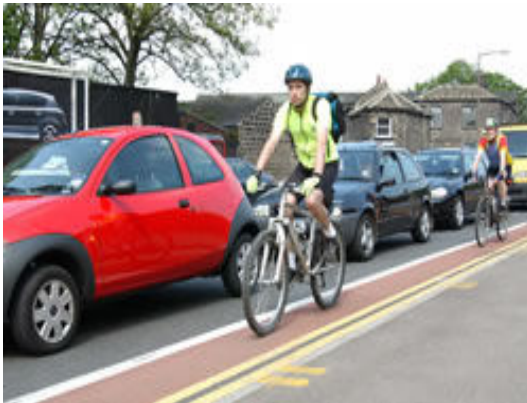
Cyclists Kirkstall Road