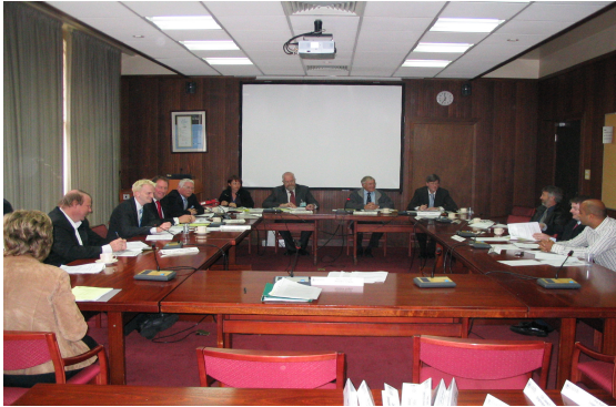
Scrutiny Board (Development)

We commenced this inquiry last year on the Leeds City Region. We wanted to know what the current Government thinking was on this issue and obtain details of other city region initiatives. We were keen to examine more specifically the implications of this work for the delivery of the aspirations in the Council's Corporate Plan. In particular we were interested in what difference it could make to the development of high quality transport and the delivery of the skills agenda? Since concluding our inquiry the Leeds City Region partners have joined forces to deliver a dynamic, successful and prosperous city region that supports innovation and enterprise and is capable of competing with the best that Europe has to offer. It has agreed the City Region Development Programme which has been signed by the 11 Councils which make up the partnership.